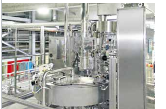
↻ Sterilcap IM details